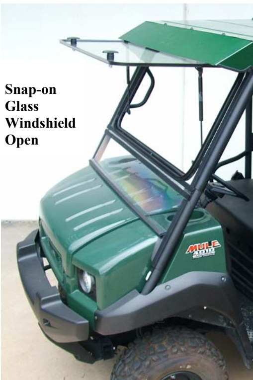
Snap-on Glass Windshield Open

MOLDED FLOORMAT The one piece molded floormat features a non skid surface and 1/2" thickness for comfort and insulation.