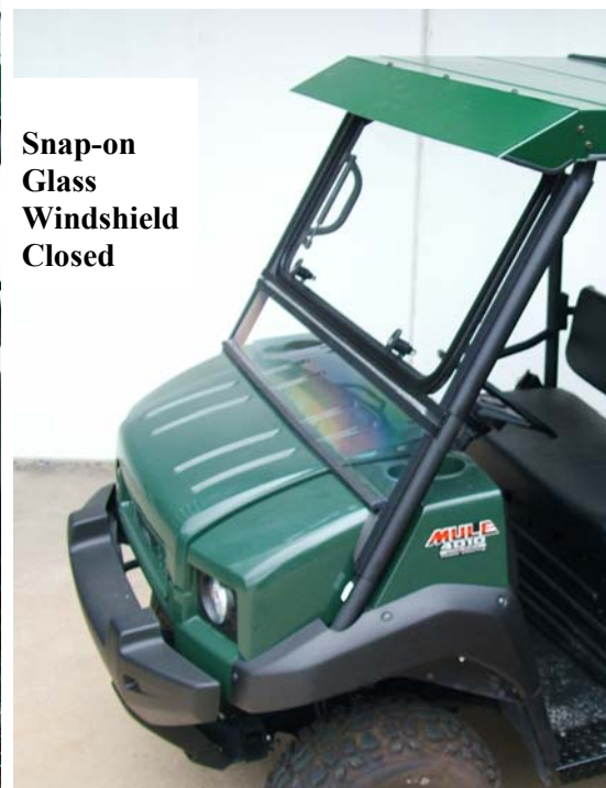
Snap-on Glass Windshield Closed