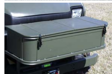
Enclosed Front Storage Basket