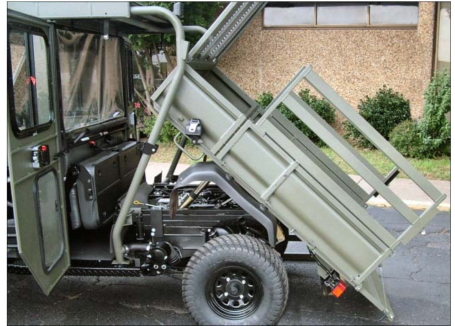
Extended Bed, Optional Side rails & Elec. Lift