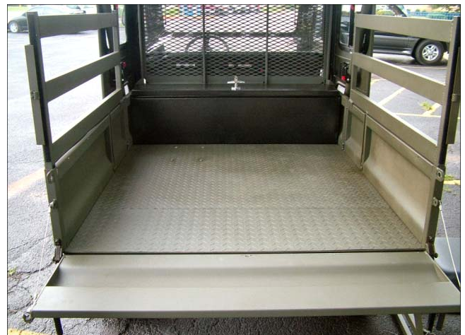
With the rear seat stored, The bed is 62", The Hardtop retracts to allow full use of the extended bed