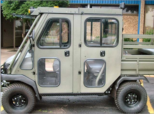
Cab enclosure with lift windshield & Steel Doors

The 'T-LATTV' outfit for the 4010 Diesel TRANS Mule consists of a color conversion to Olive Drab [MS 36048] or Desert Tan [MS 33446] and sixty of our proven accessories. Key among them, Essex modular cab system features our trademark Lift Safety Glass Windshield to provide excellent visibility and flow thru ventilation. Together with the lift off doors , they provide 4-way circulation that makes an Essex cab practical even in hot summer and southern climates. The frame is reinforced for strength and formed for tongue and groove installation with a minimum of fasteners. It includes a preinstalled dome light, an electric wiper and a fused accessory harness for easy installation of electrical accessories. Some of the other items are shown below: