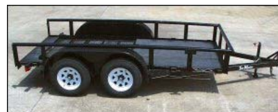
Trailer12 w/Spare, Pipe

Options for carrying additional cargo include the 3x5 Utility carts and trailers