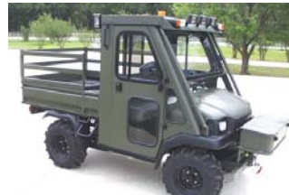
Olive Drab LATTV