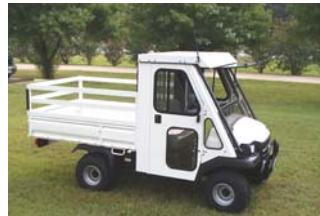
White & 3000EX20