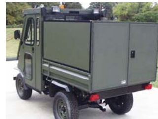
3000CC: OD Cargo Cover, Van Doors

Options for carrying additional cargo include the 20" Bed Extension and the Cargo Cover.