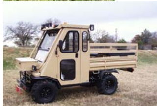
Desert Tan & 3000EX20